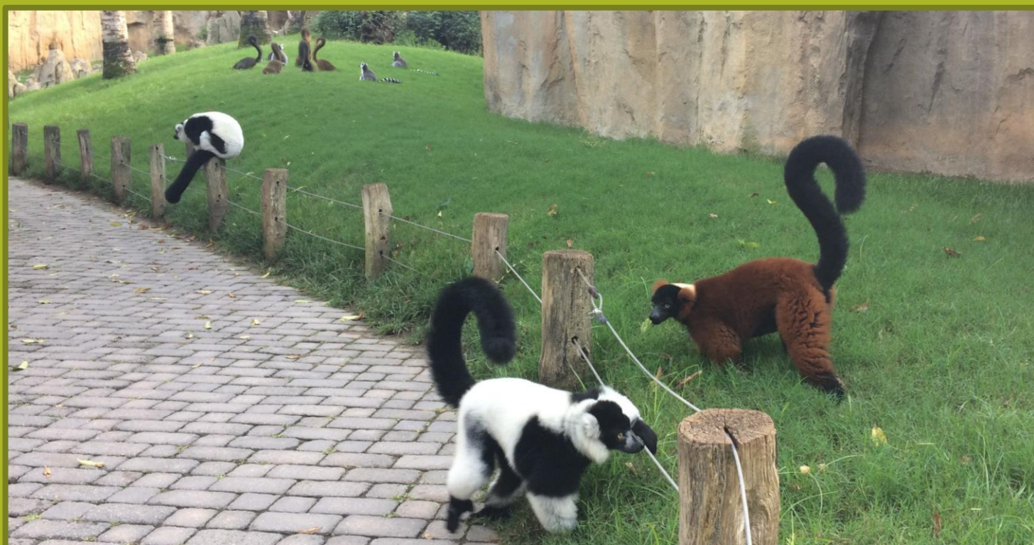
Mixed-species exhibit in Bioparc Valencia

I observed the behaviour using scan sampling by species, and one-zero sampling for the behaviours. I observed 9 different behaviours: Resting, locomotion, groom, play, attack, chase, vocalize, scent mark and mate.