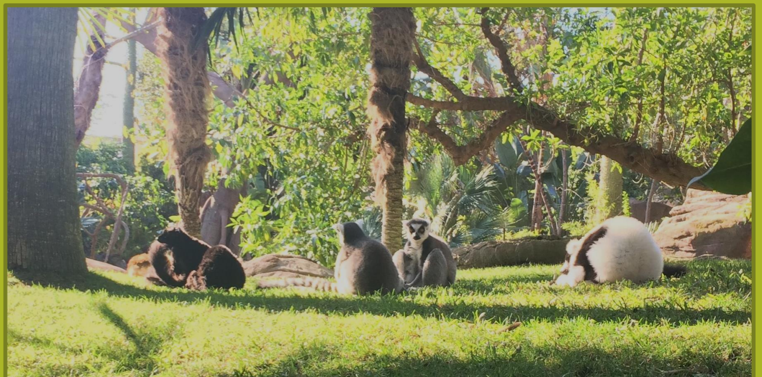
Mixed-species exhibit in Bioparc Fuengirola