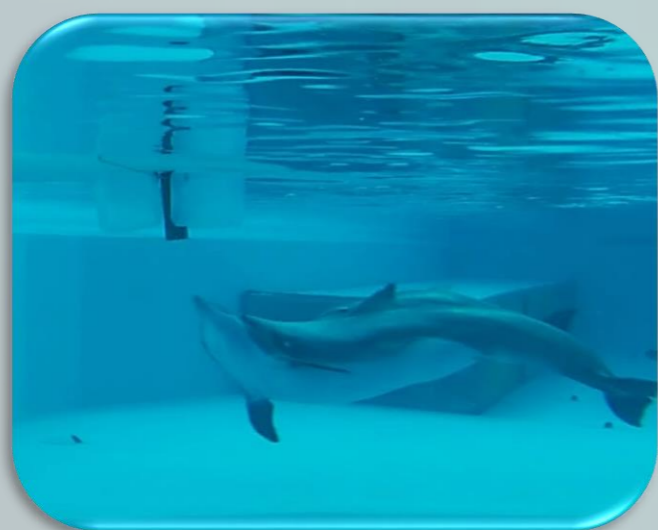
Figure 2. A dolphin echolocating towards the control setup fixed under the floating platform.