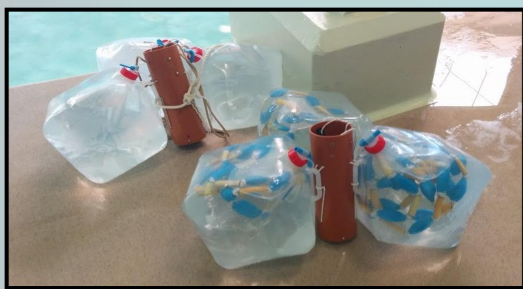
Figure 1. The setup consisted of three soft plastic bags and a plastic tube containing the PCL in the middle. The blue and yellow object in the bags in the foreground are plastic, air-filled floats.

Three scenarios (control, float and fish; fig 1) were used to investigate whether dolphins would prefer live fish as sonar targets instead of air filled floats, which simulate the swim bladder of a fish. Empty bags were used as control. The scenarios were tested in a total of seven days each on 8 dolphins at Kolmården Wildlife Park. During the test the bags were fixed under a floating platform in the Laguna (fig 2) for 4 hours. A porpoise click logger (PCL), placed in the center of the setup, recorded all the clicks the dolphins directed towards the setup. A video camera was used to record all the behaviours the dolphins directed towards the setups.